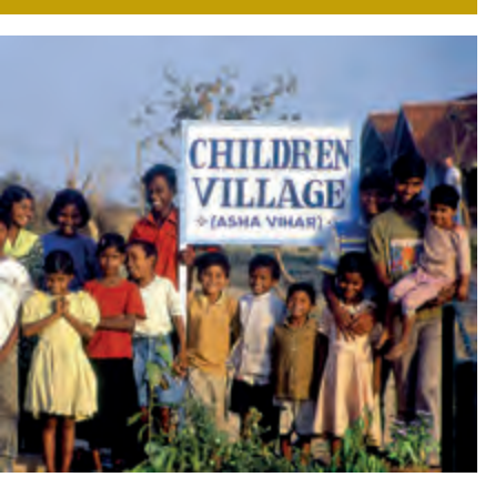
25 Euro ...

... of these, the monthly cost for the nourishment of our children can be paid.