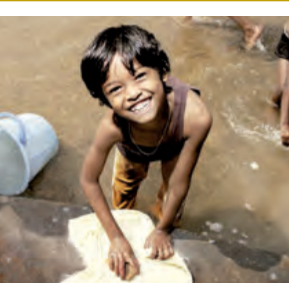
40 Euro ...

... are costs of the articles for body care (soap, dental cream, brushes, etc.) and clothing of a child a year.